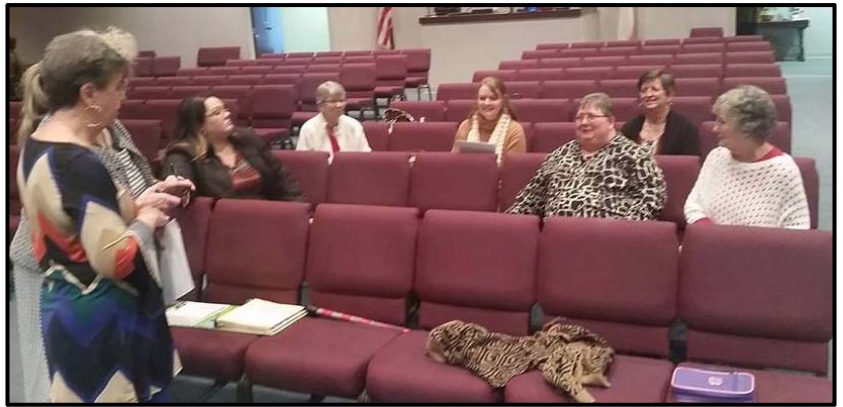
Ladies meeting to discuss the Sewing with Love ministry

"One sows and another reaps," John 4:37. This verse sums up the servant attitude that is at the heart of the Sewing with Love Ministry. Ladies, young and seasoned, are coming together to minister to hurting people in our community. Whether you sew, knit, quilt or crochet this sewing ministry is a creative way of fellowshiping and reaching out to meet the needs of people experiencing real life issues. Sewing with Love can benefit a variety of individuals or groups like nursing homes, hospital patients, homeless shelters, or crisis centers. We will put our talents for sewing and working together to create many items for use in our community. Prayers will be offered specifically for the intended recipients as the ladies sew mats, lap quilts, caps, adult bibs, etc. Ladies who do not sew are still a part of this ministry by cutting, pinning, ironing, and assembling. As the old saying goes, "Many hands can make light work."