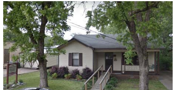
New Beginnings Pregnancy Resource Center in Benton